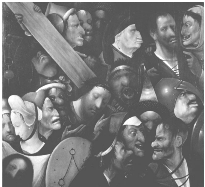
Christ carrying the cross: Hieronymus Bosch, 1515-1516

Look at the picture (right), by Hieronymus Bosch. In it, Christ carries his cross through a crowd in which there seems to be not one sympathetic character. Even St Veronica, the legendary figure who was supposed to have wiped Christ's face with a cloth which then retained his image, who we can see in the bottom left hand corner, seems to be more interested in the cloth than in him. Look back at the account of the crucifixion (15.21-39) – read it slowly. Just as in Bosch's picture there is not one sympathetic character here either; no penitent thief defending Jesus, none of Jesus' disciples close by (the women watch from a distance – 15.40). Jesus is entirely alone. Spend some time in silence reflecting on this.